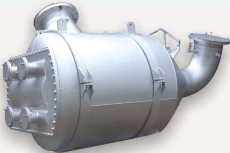
Gas Inter Cooler